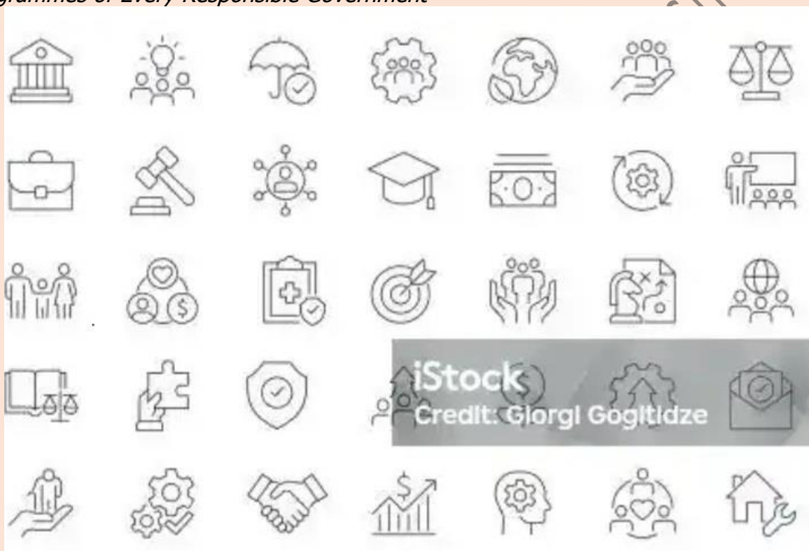
Figure 2.0 below is a Pictogram showing some of the Activities, Policies and Programmes of Every Responsible Government

To achieve all these, an interactive platform or a kind of TOWNHALL GATHERING needed to be organized at regular interval (say, every Three 3 Months) where representatives of each town, village and ward will be in attendance so as to mention and discuss a number of key and most important projects they needed in their respective areas.